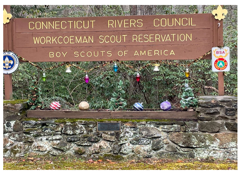
Decorations are out, snow is coming!